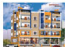
Anish Residency Nzpt