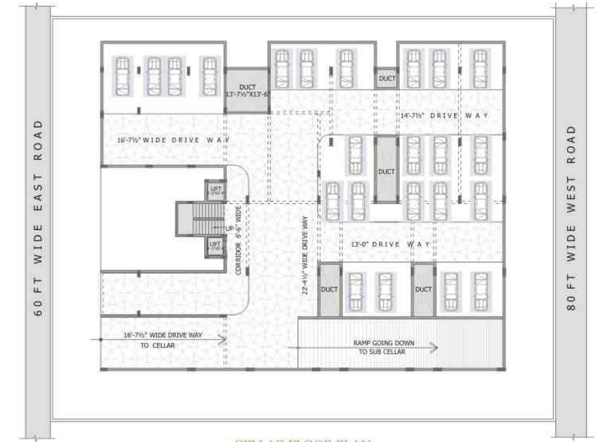
CELLAR FLOOR PLAN