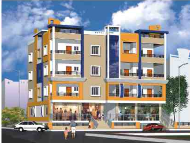
Anish Residency - a premium quality Residential and Commercial spaces located on Nizampet Main Road, Hyderabad