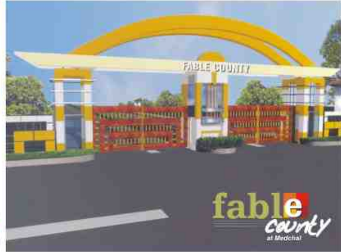
Fable County - a fully developed 64 acres layout with all amenities and a premium clubhouse located on Shameerpet Road, Medchal, Hyderabad

Sumashaila Infrastructures is creating its own unique brand for high-end lifestyle apartments and commercial spaces across Hyderabad and India. With an impeccable track record in our repertoire, success had been just a passé. Our mettle for perfection is driven by our diverse workforce who has certain things in common a tireless work ethic, pride in everything we do and a deep connection to the organization. Well, these are traits that can't be seen, qualities that don't appear on a balance sheet!